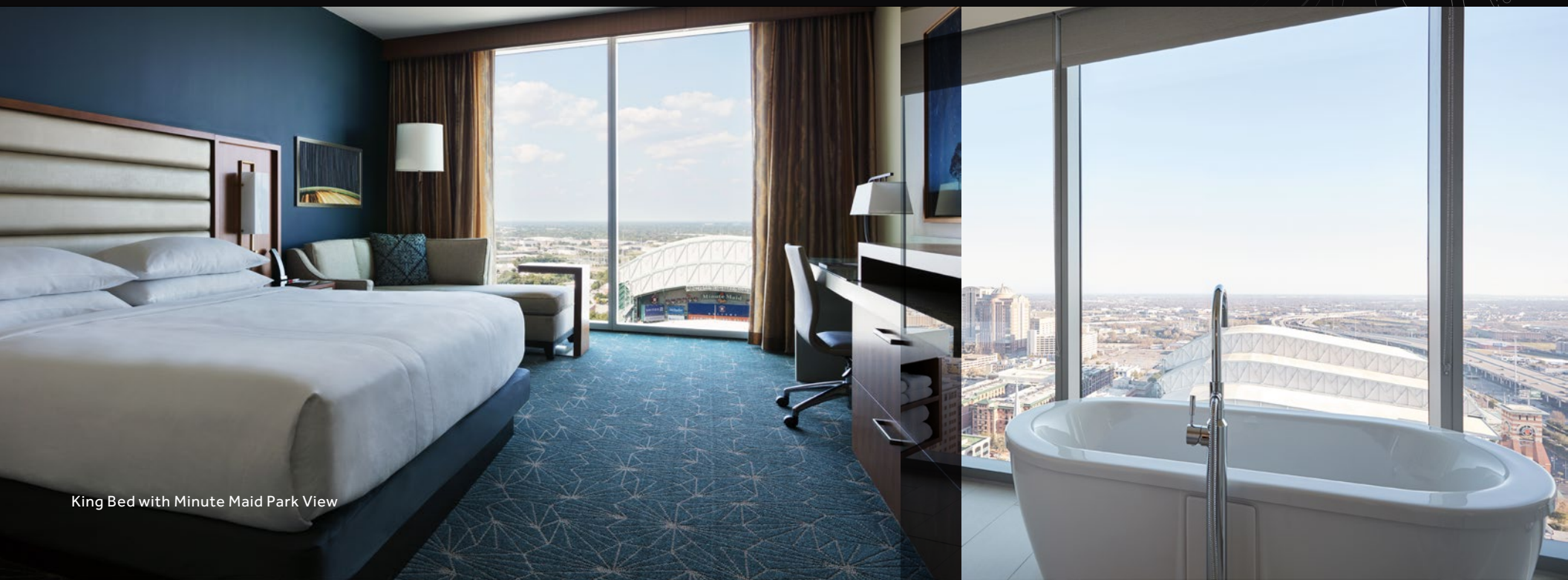
King Bed with Minute Maid Park View